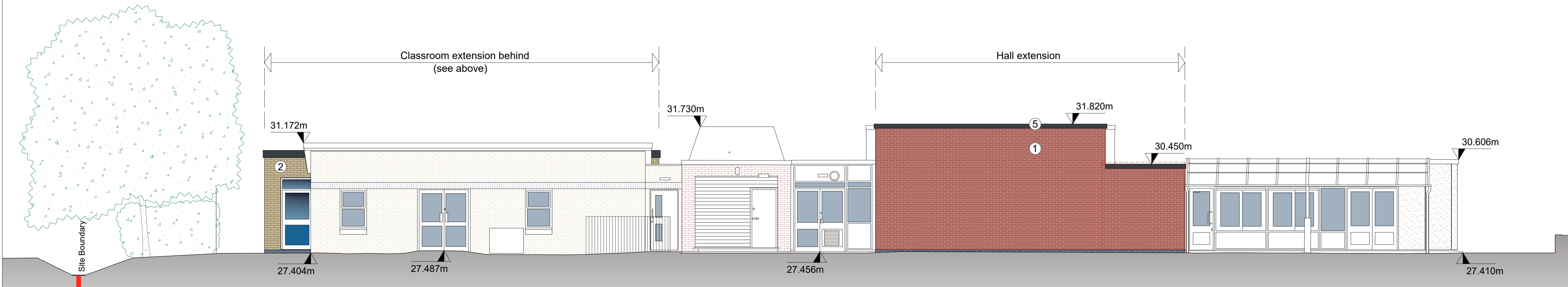
West / Left Elevation